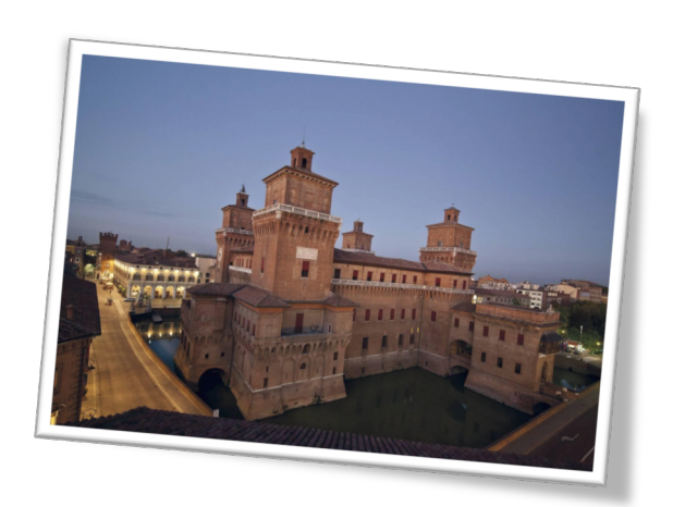
Ferrara, The castle